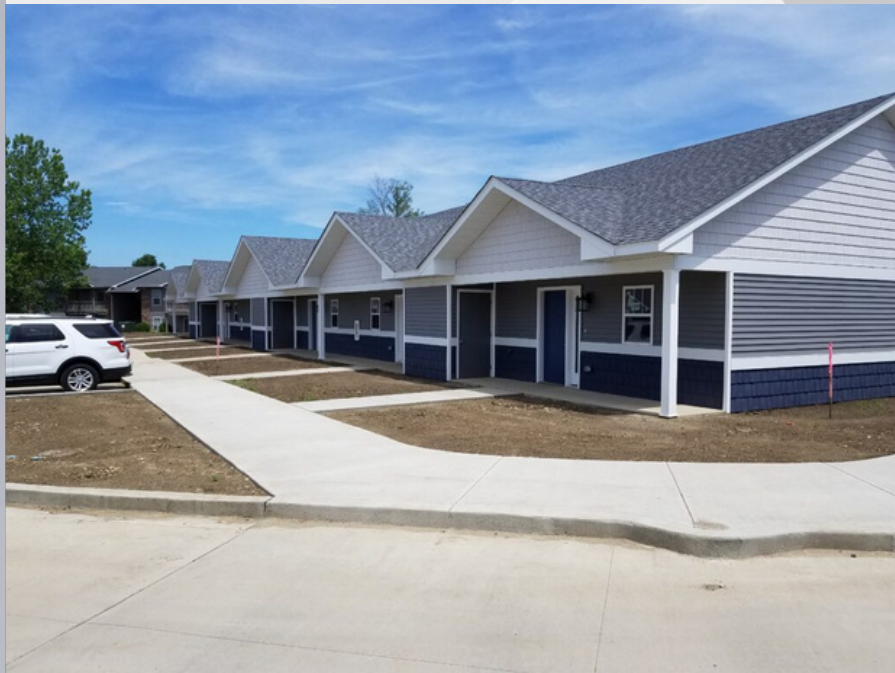
Pinewood Place located in Urbana, IL.

15 Clients moved into permanent housing after starting with our program. 12 were able to secure a unit at the newly built Pinewood Place, a subsidized community for individuals who are currently awaiting an approval from the Social Security Administration.